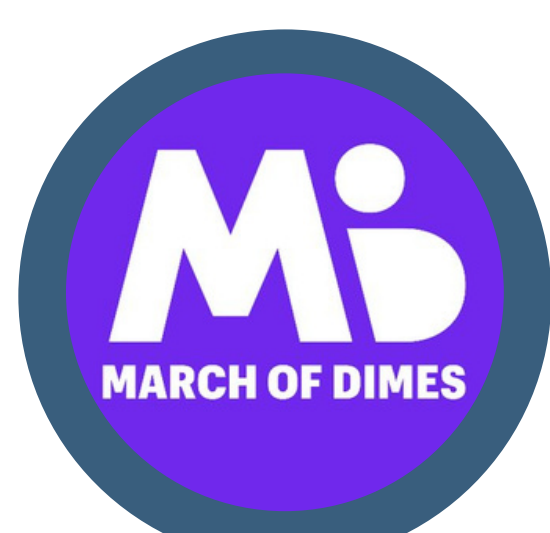
MARCH OF DIMES